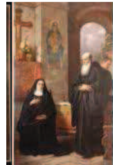
Sts. Benedict and Scholastica

I was martyred in Roman Emperor Diocletian time persecutions. When I confessed Christ and I was thrown from a rocky precipice.