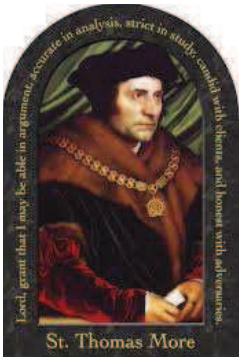
Our Patron Saint