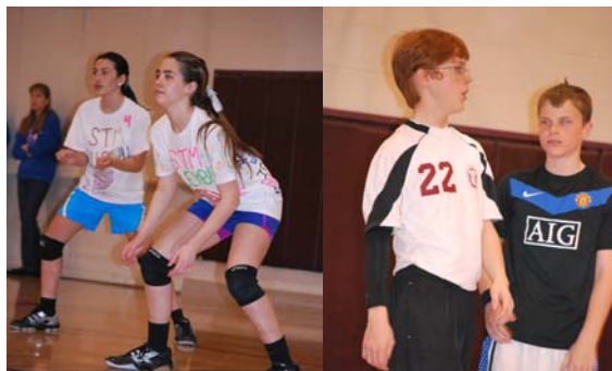
8th Grade Girls and boys played the faculty.