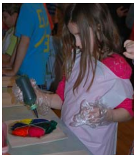
SPRING FEST, 2013

Enjoy some pictures of Spring Fling, 2013!