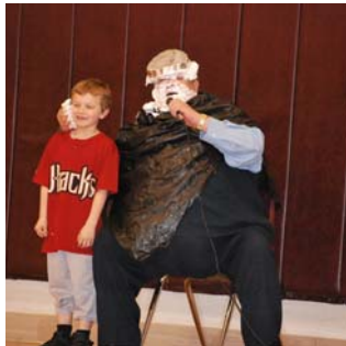
Some Principal's will do anything for the kids!