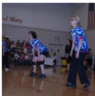
Faculty VB Team