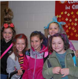
Funny Hair Day

The kids, faculty, staff had a BLAST during "Spring Fling" week you planned for the STM Students!